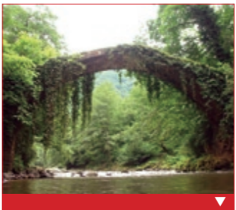
NATIONAL PARKS Nearly 40% of Georgia's territory is still forest. There are more than 40 Protected Areas specially identified for conservation. Borjomi-Kharagauli is the largest National

spectacular vista, their walls still covered in striking religious frescos.