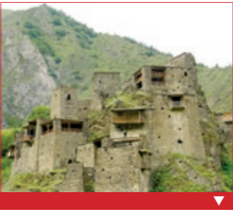
SHATILI – H4 The remote village of Shatili stands as an outstanding and unique example of fortress architecture. Located on the northern slopes of the Greater Caucasus, beyond a high pass, the village is composed of some 60 towers all clustered together to form one large protective building.