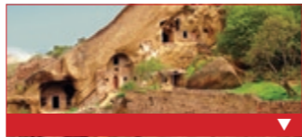
David Gareji (H7) – This grandiose complex of cave monasteries located in the semi-desert just south of Tbilisi, was established in the 6th century. It once housed over 10,000 monks and although it fell into neglect, today it functions as a monastery once more. Set on the top of high cliffs, the caves look out across a

spectacular vista, their walls still covered in striking religious frescos.