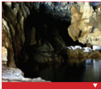
GROTTO – D5 Western Georgia is home to many long, deep karstic caves and some have underground rivers allowing you to have the extraordinary experience of boating in

Park in Europe and is the only member of PAN parks in the Caucasus region.