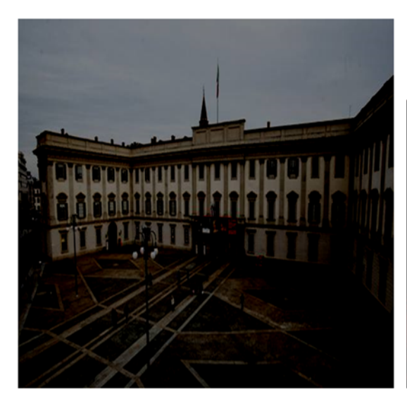
Palazzo Reale, Piazza Duomo 12 Solferino, 19