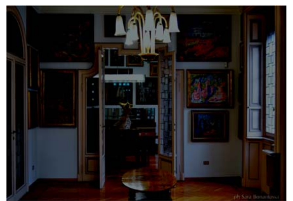
Casa Museo Boschi di Stefano, Via Giorgio Jan, 15