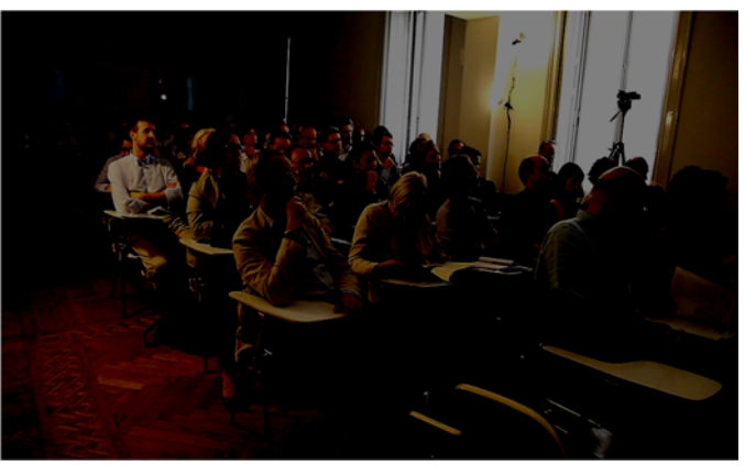
Ordine degli Architetti di Milano, Via