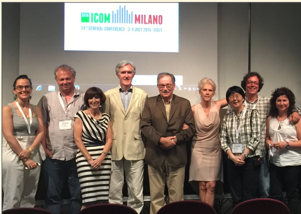
Milan 2016 ICMEMO Board