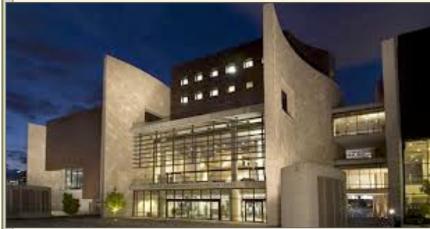
NATIONAL UNDERGROUND RAILROAD FREEDOM CENTER, HOST OF THE ICMEMO-ICAMT 2017 CONFERENCE

A Special Advisory Committee of seven Board Members and past ICMEMO Chairs traveled to Vilnius, Lithuania in October to advise our member institution Vilna Gaon State Jewish Museum. Working together with Museum staff, the Committee met with Ministers, Parliament members, the President of the Jewish Community, toured historic sites, and recommended an action protocol.