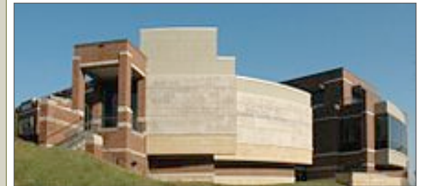
The Jacob Rader Marcus Center of the American Jewish Archives in Cincinnati

MEMORY BUILDING: ENGAGING SOCIETY IN SELF-REFLECTIVE MUSEUMS