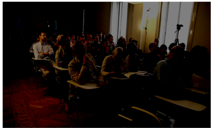
Ordine degli Architetti di Milano, Via