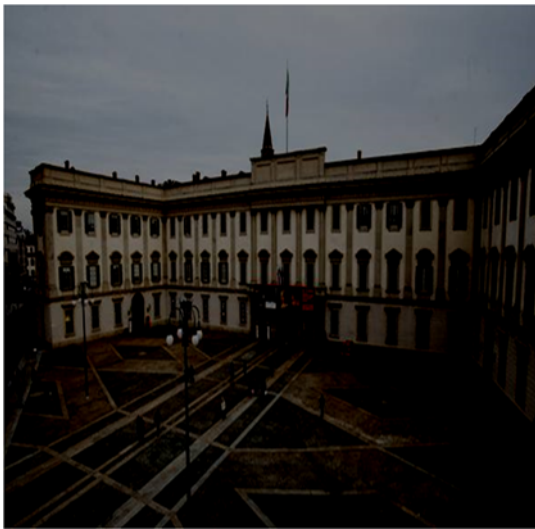
Palazzo Reale, Piazza Duomo 12 Solferino, 19